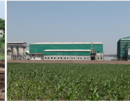
Industrial Shed, Boiler & Machine foundations, at Dalkhola, West Bengal