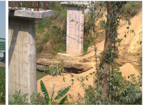
Construction of Bridge over River Chite for Mizoram PWD