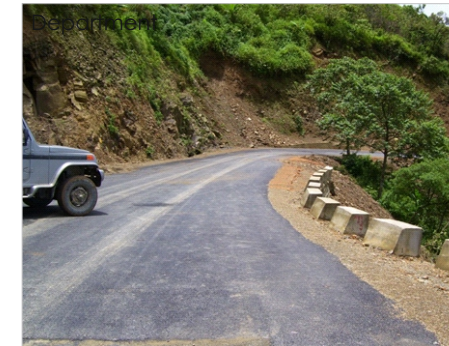
Improvement & Upgradation of Serchip to Buarpui Road (MZ02) (Project - 2 Road in the State of Mizoram)