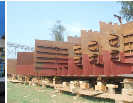
River Barge Fabrication of 120m length for carrying of Bridge Support Trestles