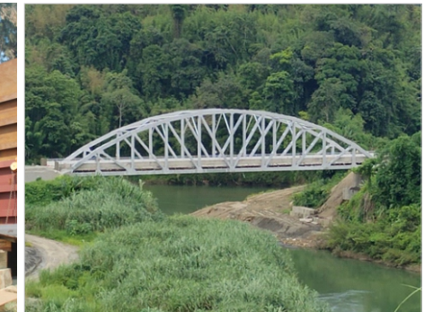
Construction of 2 nos. 63 m & 80 m span Bowstring bridge on Rivers Mat and Tlwang