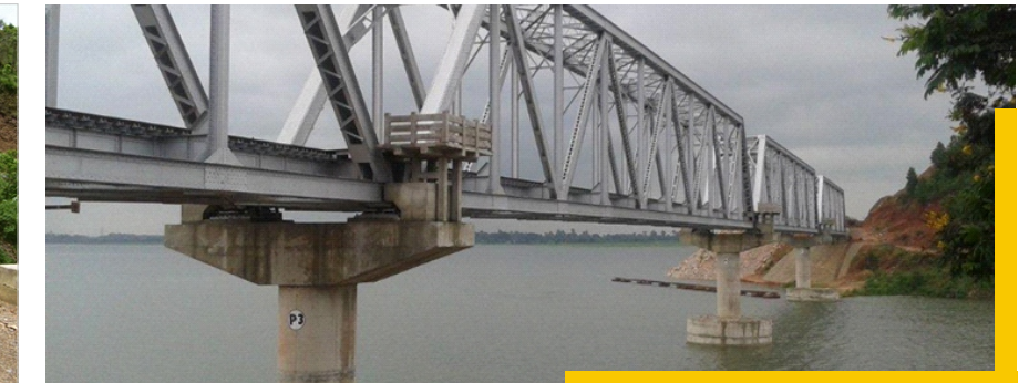
Construction of New Bridge no. 26, 27 & 28 at Km 18.240 including construction of bore Piles, sub-structures, fabrication and erection of steel girder superstructures over Teliya Reservoir between Koderma and Hazaribagh.