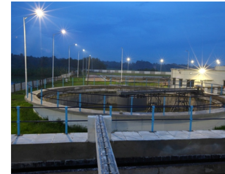
Area development and Boundary Wall of Sewerage Treatment Plant under West Bengal Public Health Engineering