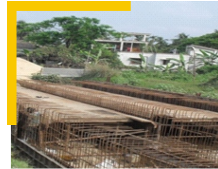
Sewer network and construction of Manhole for Kolkata Municipal Corp.